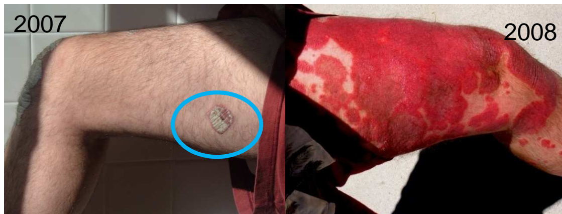
Left leg, 1 month before and 4 months after Stelara