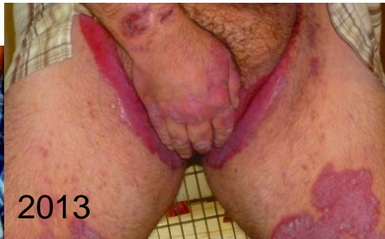
Same leg, same month