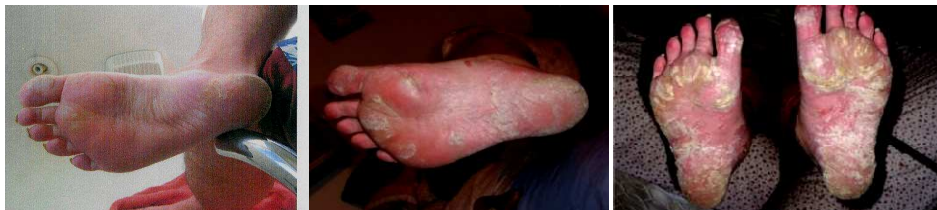
Just before Stelara